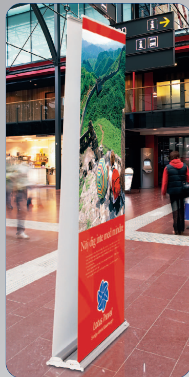
Also available as a double-sided version

The double-sided version of the Roll Up Professional System is an added attraction: Two graphics in each system lend weight to your message. After all, two is always better than one!