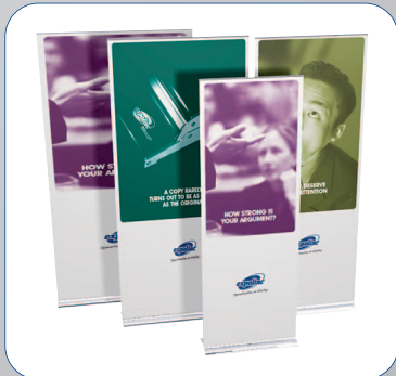
You can choose from four widths