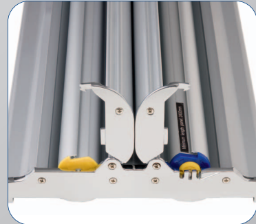
Roll Up Professional: Double sided version with two graphic banners