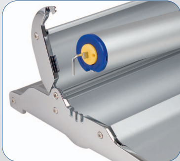
Roll Up Professional: Just a few turns to change the banner