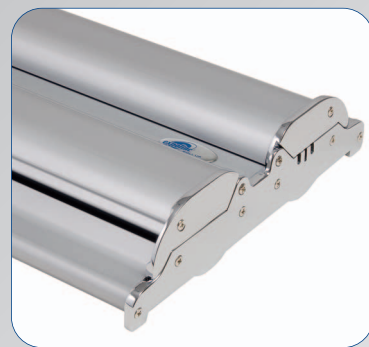
Roll Up Professional, here the double-sided version, in stylish silver