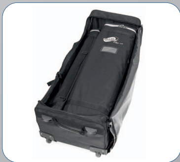
The multi-bag holds up to five Roll Up systems