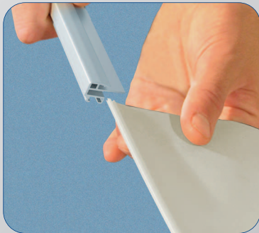
The slide-in method sees to quick graphic changes