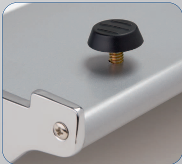
Adjustable bases compensate for uneven floors