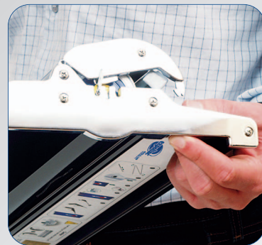
Just a click underneath to replace the graphic