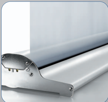
Attractive design and stable