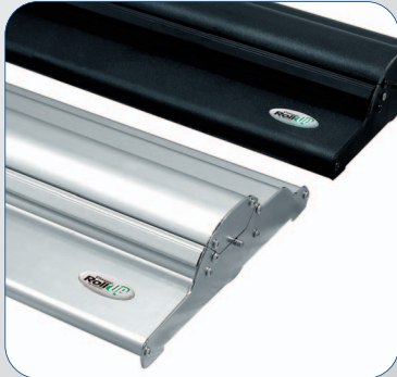
Colour: silver or black